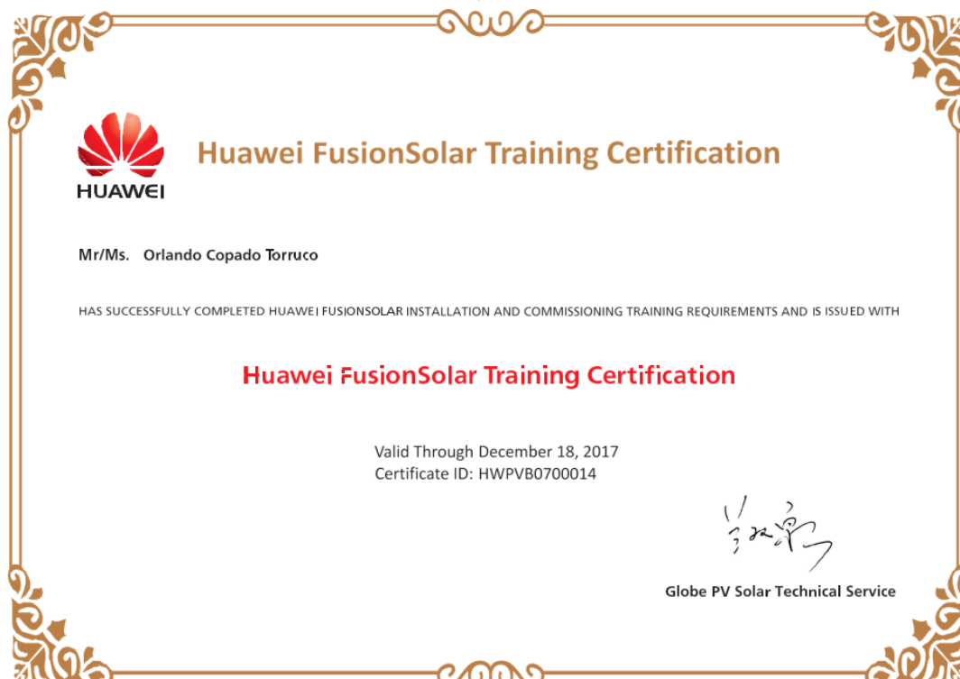
Figure 4-1 the Training Certification

After collect the exam passed list Romania team will send to customer the last week of every month